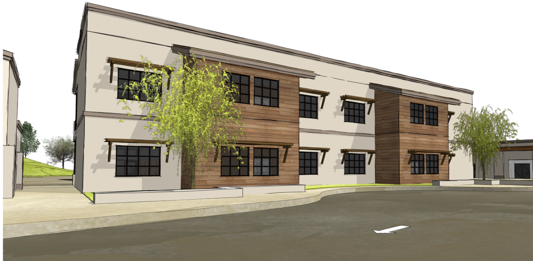
② BLDG B - SOUTH SCALE