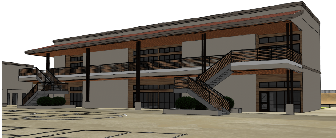
① BLDG B - NORTH VIEW SCALE