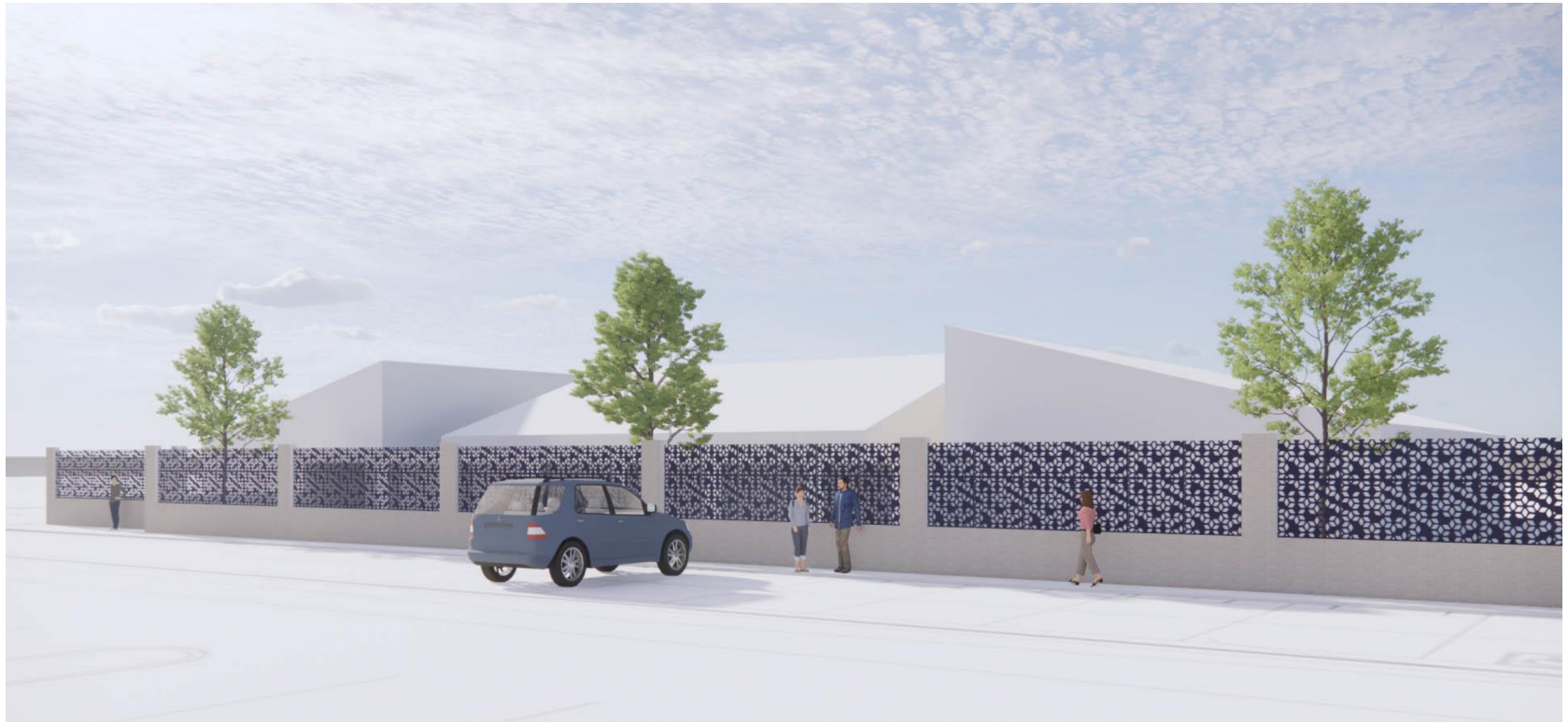
OPTIONS FOR 5'-0" HIGH PERFORATED METAL PANELS ON TOP OF 3'-0" HIGH CMU